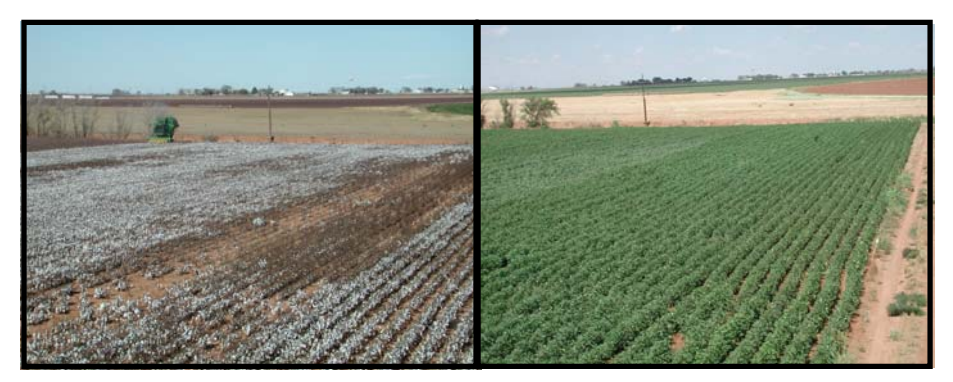
Figure 1. An area in Field 3 where emitters were plugged with Mn oxides in 2002 (left) and the same location following emitter cleaning during the 2003 growing season (right). A procedure was used to keep dissolved Mn in solution to reduce the probability of future emitter plugging.

Methodology: Deposits manganese of (Mn) compounds caused by Mn in the well water were plugging drip emitters and causing severe plant stress within SDI zones during the 2002 growing season. The emitters were unplugged in the Fall of 2002. In 2003, a low concentration of hydrogen peroxide (H_2O_2) was