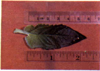
True leaf — 4 cm