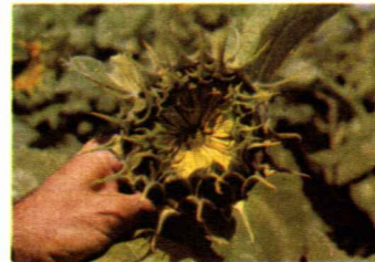
R-4 Top View