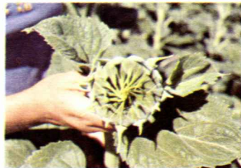
R-3 Top View