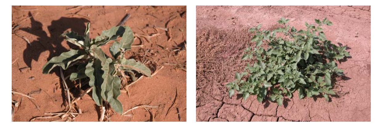
Two weeds, silverleaf nightshade (left) and black nightshade (right) are related to tomatoes and may be difficult to control with herbicides. Silverleaf nightshade is a perennial with an extremely deep tap root, thorny stems and leaves; black nightshade is an annual weed with a fibrous root (easily pulled out).

When spraying commonly-used broad-spectrum herbicides like Roundup (glyphosate) around tomato plants, be careful not to drift any on the leaves as this may kill or severely stunt tomato plants. A carefully placed paintbrush or Q-Tip dipped in the concentrated herbicide can be used to wipe any weed leaves around and within the tomato canopy. Avoid using any broadleaf weed killers that contain active ingredients like 2,4-D, dicamba or other products containing Trimec as these may volatilize and be taken up by the tomato plant. Don't use the same sprayer for applying fungicides after using it with herbicides as the used sprayer may cause injury to the plants. Most injury can be seen as deformed leaves and/or twisted plants. Once these plants have been affected, there is usually nothing that can be done to alleviate the problem. Use extreme caution with herbicides around tomato plants and always READ AND FOLLOW THE LABEL INSTRUCTIONS FOR ANY HERBICIDE . For commercial growers, there are more herbicide choices available for use.