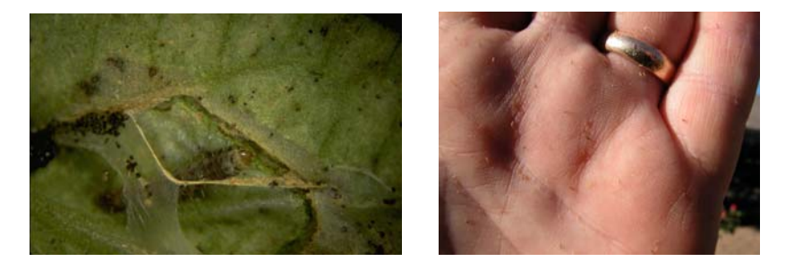
A tomato pinworm larvae (left, courtesy of Bart Drees), and right; thrips shaken off the plant and onto the hand (courtesy of Pat Porter).

Thrips – Small, agile insects with rasping, sucking mouth parts, and are approximately 1/16 to 1/8 inch long with four feathery-like, hair-fringed wings. They are difficult to see and mostly live in the flowers and vegetative tips of the plant where they can feed on new growth of tender young plants. A good way to sample for thrips is to slap the terminal part of the plant onto a white sheet of paper and then look for the tiny, brownish or tan thrips. Consider chemical treatment as soon as they are detected. Most gardens experience a large influx of thrips when the local wheat begins to dry down in June, and this influx can continue for many weeks.