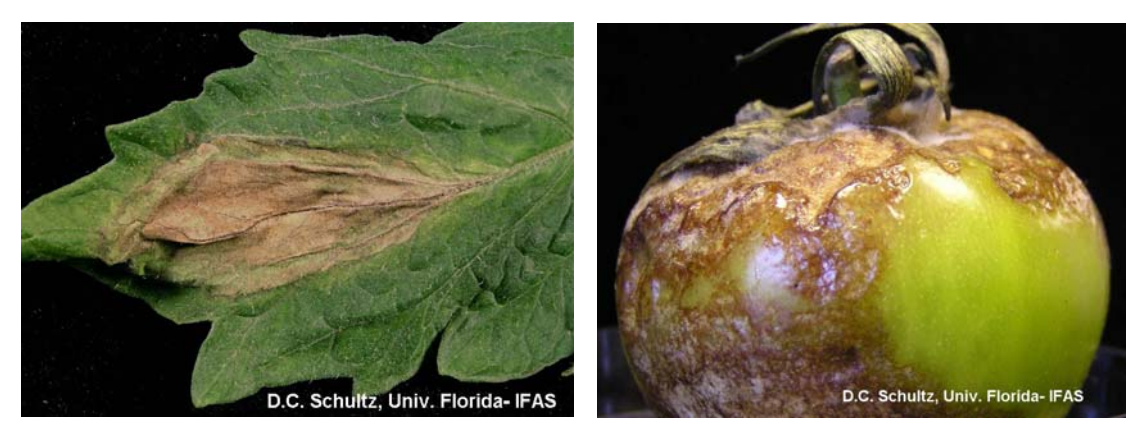
Water soaked lesion caused by Phytophthora infestans on a tomato leaf (left). Fruit lesions on a tomato fruit can develop a moldy growth under humid conditions that also promote fungal sporulation (right).

Fusarium wilt ( Fusarium oxysporum f. sp. lycopersici ) – Tomato seedlings will become stunted and develop poorly when infected with this fungus. In older plants, symptoms on older leaves include chlorosis, leaf drooping with a downward curve, and wilting. Plant wilting, collapse, and death are further consequences of disease progression. If stem vascular tissue is observed, infected tissue is dark brown and the base of the stems is enlarged. Vascular discoloration can be observed on upper stems as well. To manage this disease, resistant cultivars should be used. Avoid fields with heavy infestations of root knot nematodes since they could facilitate the fungus in overcoming plant resistance.