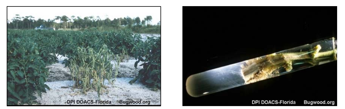
Wilting of a tomato plant as a result of infection by Ralstonia solanacearum , the causal of bacterial wilt on tomato (left). A sign of bacterial wilt is bacterial oozing from a cut stem piece after being placed in a clear container with water.

Bacterial wilt (Ralstonia solanacearum) – First symptom is wilting of the upper leaves during the warmest time of day, though plants may recover at night. Plants will become stunted or completely wilted and die. In the lower stem, vascular tissue exhibits a dark brown discoloration. If a cut in the lower stem is placed in water, bacterial ooze is an indication that this pathogen is present. Disease is favored by high temperatures (85-95 °F) and soil with high moisture content. Control of bacterial wilt is difficult. Avoid fields with a history of R. solanacearum , rotate crops with a non-susceptible crop, and raise the soil pH to 7.5 or liming are some cultural practices to manage this disease. Moderately resistant cultivars are available but might not be suitable to the area or must first be tested for adaptability to a specific location. Soil fumigation has only achieved limited success.