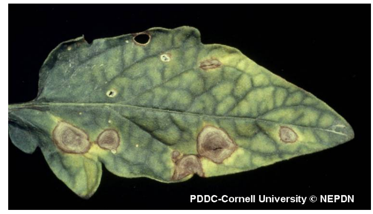
Symptoms of early blight on tomato leaf. Enlarged spots show the typical concentric rings that can be seen in the center of the diseased area.

Late blight (Phytophthora infestans) – Late blight is a fungus that appears on the leaves, with irregular, large, dark green lesions with a water-soaked appearance. These lesions enlarge rapidly and turn brown. Under humid conditions, the lesions will develop a white moldy growth near the margins of the diseased area on the lower leaf surface or on stems. Disease development is favored by cool nights (50-60 °F) and days with mild temperatures (70-80 °F). Late blight may spread rapidly and large areas of leaves can be affected. Infected fruit may have large, green to dark brown lesions that appear mostly on the upper half of the fruit; but they may also occur on other parts. White moldy growth may also appear on fruits under humid conditions. The fungus produces abundant spores called sporangia, which may be spread by splashing rain or wind. These spores can easily infect healthy leaves, stems and fruit if climatic conditions are optimum. Hot and dry weather reduces disease development. Control practices include crop rotation so as not to follow potato or tomato, avoiding planting tomatoes near potatoes, and using disease-free seed and/or healthy transplants. Crops should be sprayed regularly with a registered fungicide. Spraying should begin whenever weather conditions are favorable for disease development. Applications should continue on a 7 to 10 day schedule until harvest.