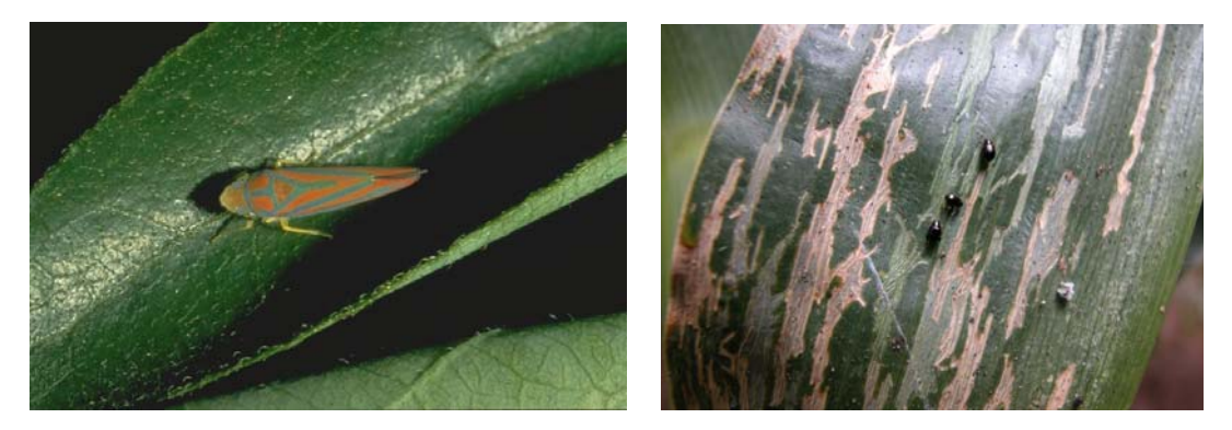
A typical leafhopper (left) and right, flea beetles and damage on a leaf surface.

Flea beetles – These insects are very small, black or brown in color, though some may be metallic blue or green, or even striped. Flea beetles eat tiny holes in the tomato foliage and heavy populations may defoliate a small plant. There are often large flea beetle infestations in May and early June. Consider control when there is significant damage on young plants and flea beetles are present. Older plants can withstand more damage, and control may not be warranted.