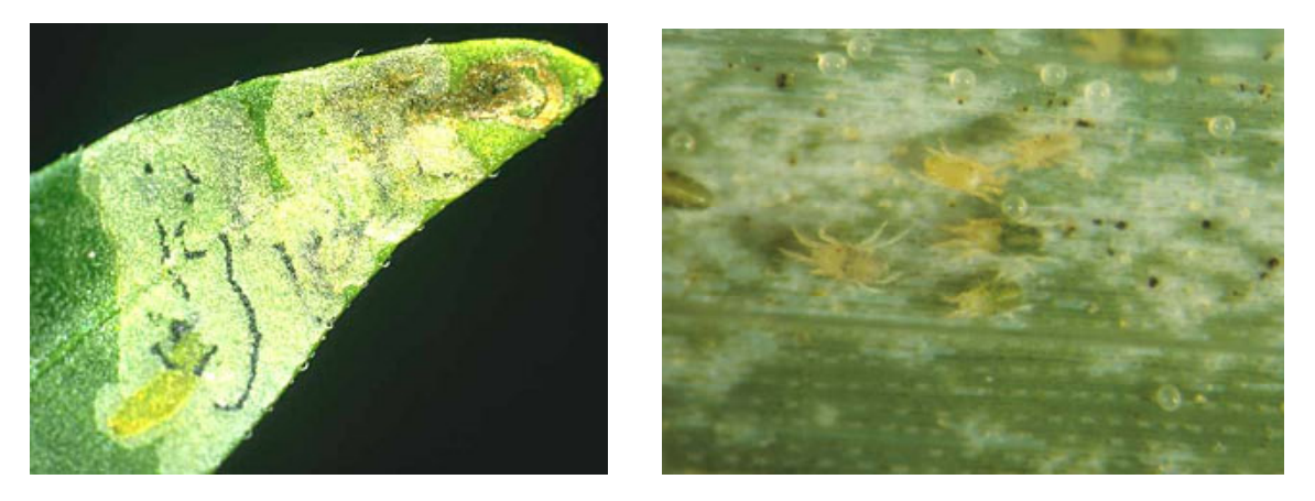
Leaf miner damage or tunnels (left) and right, spider mites, eggs and rasping damage on a leaf surface.

Spider mites – Mites are one of the most serious tomato pests on the High Plains. They are green or reddish in color and are very small. Spider mites will rasp leaf cells and suck the sap that exudes from tomato leaves. Heavy infestations will cause leaves to turn yellow and eventually drop off. As a practical matter, control should begin when mites and damaged leaves are first observed. Control may be difficult, and applications may be required at 5-day intervals for 3 – 4 weeks. If left uncontrolled, colonies usually grow rapidly during hot weather. Spider mites do have natural enemies, but at a garden scale these are usually ineffective at reducing populations. Plants should be kept well watered as spider mites increase more rapidly on drought stressed plants.