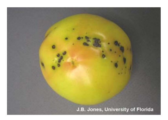
Bacterial speck on fruit. Lesions will continue to expand.

The bacterium is seed borne but can potentially survive for six months in crop residue. Weed species can also serve as alternative hosts for this bacterium. High humidity and low temperatures (64-75 °F) favor disease development. Seed treatments should be employed and disease-free transplants should be used. Copper bactericides or copper bactericides or other combinations are an option for disease management.