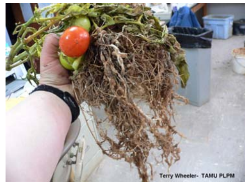
Tomato plant infected with root knot nematodes that form galling on the roots.

Prevent a buildup of nematodes by maintaining high organic matter in the soil. Since these nematodes have a wide host range, weeds and volunteer crops should be controlled. Use of resistant varieties is the most effective method of reducing losses caused by nematodes. Nematicides and soil fumigation are other alternatives in managing root knot nematode populations.