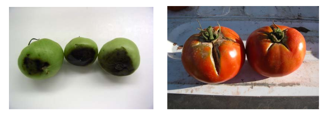
Physiological disorders of tomato fruits from non-uniform watering; blossom end rot (left) derived from a calcium deficiency and radial fruit cracking (right) due to uneven watering and plant heat stress.

The tomato plant is a "water spender" in that it can not be conditioned to thrive on limited soil moisture. Consequences of low soil moisture will include aborted flowers or blossoms, blossom end rot (a physiological disorder caused by calcium deficiency), radial fruit cracking (a physiological disorder caused by uneven watering), smaller fruit and lower yields. Drought stress will restrict leaf growth leading to higher incidence of sunburned fruit when exposed to high-intensity sunlight.