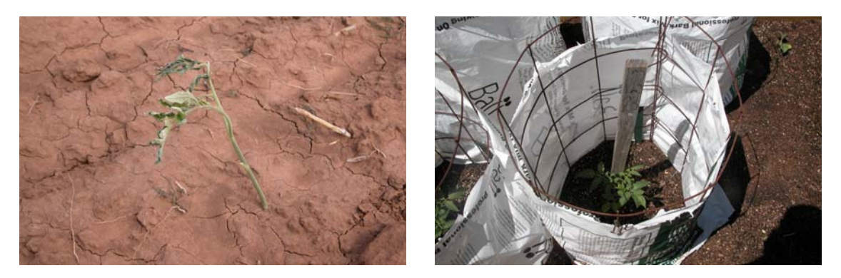
Wind-damaged tomato plant (left) that had no windbreak or cages to protect it. Note that top half of the leaves are wind-torn and shredded; it will likely fall off later. A caged and wrapped tomato plant (right) showing excellent signs of growth and will be better protected from winds.

allow rainfall to penetrate inside the cage. When leaves of the plant inside touch the wrapping, remove the cloth and/or drape the wrap over and around the cage to continue repelling insects while liberating the plant to grow and set more fruit. The wrapping can also be removed entirely if desired.