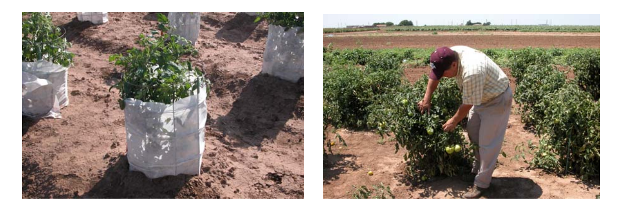
Begin to unwrap (roll down or cut) the covering off the cages as soon as the leaves begin to push through the top, and remove the entire wrap once the leaves and fruit push outward. The longer the wrapping can remain in place the better will be the protection against wind, insects and diseases.

Soil rot will likely occur if the tomato fruit are allowed to touch the ground. An organic or plastic mulch will offer some protection (see section on mulches), but caging or trellising is preferable and worth the effort. Wire cages made of reinforced wire (hog fencing, etc.) can provide excellent support systems for tomato plants. These cages can be made into various heights, but should be at least 18" in diameter. Cages of 24" diameter may be too wide to allow easy access to early setting fruit. Caution should be taken during the growing season for wasp's nests built on or inside the cages, and for the black widow spiders that love to build their webs inside plant canopies!