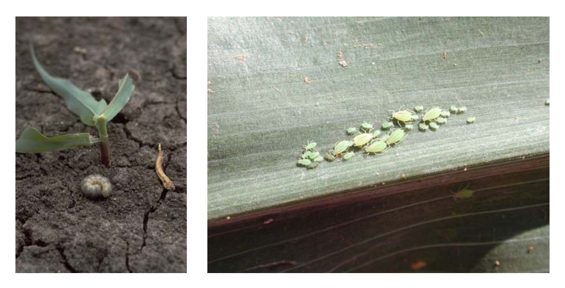
Cutworm damage on seedling corn plant (above left) and a colony of aphids (above right).

Leaf miners – Leaf miners are immature, small flies. The adults lay eggs between the upper and lower surfaces of the leaves and when hatched, the small larvae tunnel (leaving visible "mines") throughout the leaf, destroying tissue where the mines occur. Leaf miners attack tomatoes in all stages of growth; however, they do more damage to young seedlings. Consider controlling leaf miners in seedlings by applying insecticides as soon as tunneling is visible. Two or three applications at weekly intervals may be needed. Larger plants can withstand more leaf miner damage, and insecticide applications may not be warranted. Leaf miners do not attack the fruit and cause mostly cosmetic damage on older plants.