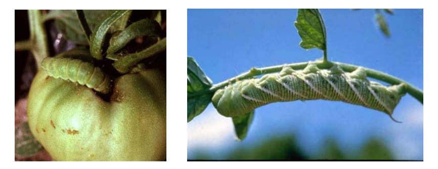
A tomato fruitworm (left, courtesy of Clemson University, Dept. of Entomology) and tomato hornworm larvae (right, courtesy of Texas AgriLife Extension Service).

Tomato hornworms – Larvae are about 3 inches long when fully grown, and are identified by green, slanted bars on the sides and a horn-like projection on the posterior end. Hornworms feed on tomato foliage and fruit, and large larvae can defoliate a plant very quickly. The larvae can be difficult to see on tomato foliage. Look for missing leaf tissue and the characteristic black frass (excrement) pellets that this larva produces. "Hand pick and squish" is an effective control measure when there are only a few plants. If many are noticed, apply appropriate chemical treatment as soon as possible. Hornworms are very susceptible to the organic and very safe insecticide, Bacillus thuringiensis that is sold for caterpillar control in garden supply stores.