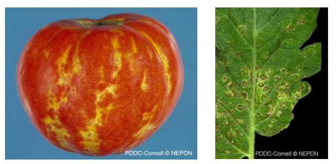
Typical orange and red discoloration can be observed (left), followed by rings that turn brown. On leaves, tomato spotted wilt virus (TSWV) will show small, dark brown spots (right).