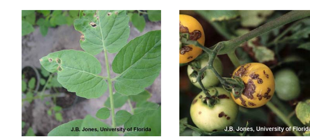
Tomato leaves exhibiting a shot-hole appearance caused by bacterial spot (left). On young fruit, spots appear as tiny, raised blisters that expand with time (right).

Bacterial spot is favored by splashing rains and weather that is moist and high in temperature (85-95 °F). Bacterial spot is difficult to control once it appears. Disease-free seed and seedlings should always be used. Crops should be rotated to avoid any previous season's tomato residue. Dry, hot weather usually does not favor disease development. Control options include copper bactericides, plant inducers and bacteriophages that target specific strains.