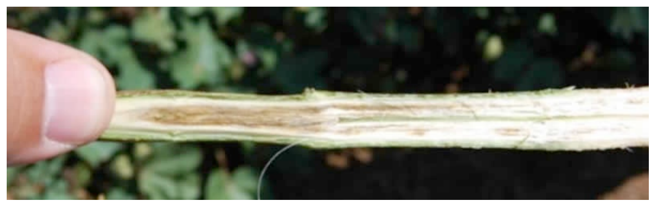
Discoloration of the vascular system of a plant infected with Verticillium dahliae

hot, dry conditions experienced this season appear to have negatively affected Verticillium wilt development. Although isolated instances were reported in July and August, incidence of Verticillium wilt in fields with a history of the disease is much when compared to previous years.