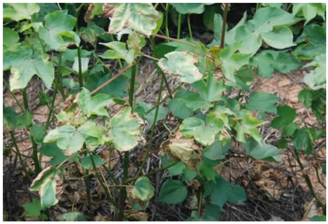
Premature defoliation of plants infected with Verticillium wilt. Note the leaves that have been shed from the lower canopy.

Verticillium wilt, caused by the soilborne fungus Verticillium dahliae, is one of the most economically important diseases of cotton on the southern High Plains of Texas. The fungus survives in the soil and crop debris as mycelia or microsclerotia (the survival structures of the fungus). Infections occur early in the growing season via penetration of roots via germinating microsclerotia. Symptoms consisting of stunting, intervenial chlorosis, pre-mature defoliation and a reduced boll load.