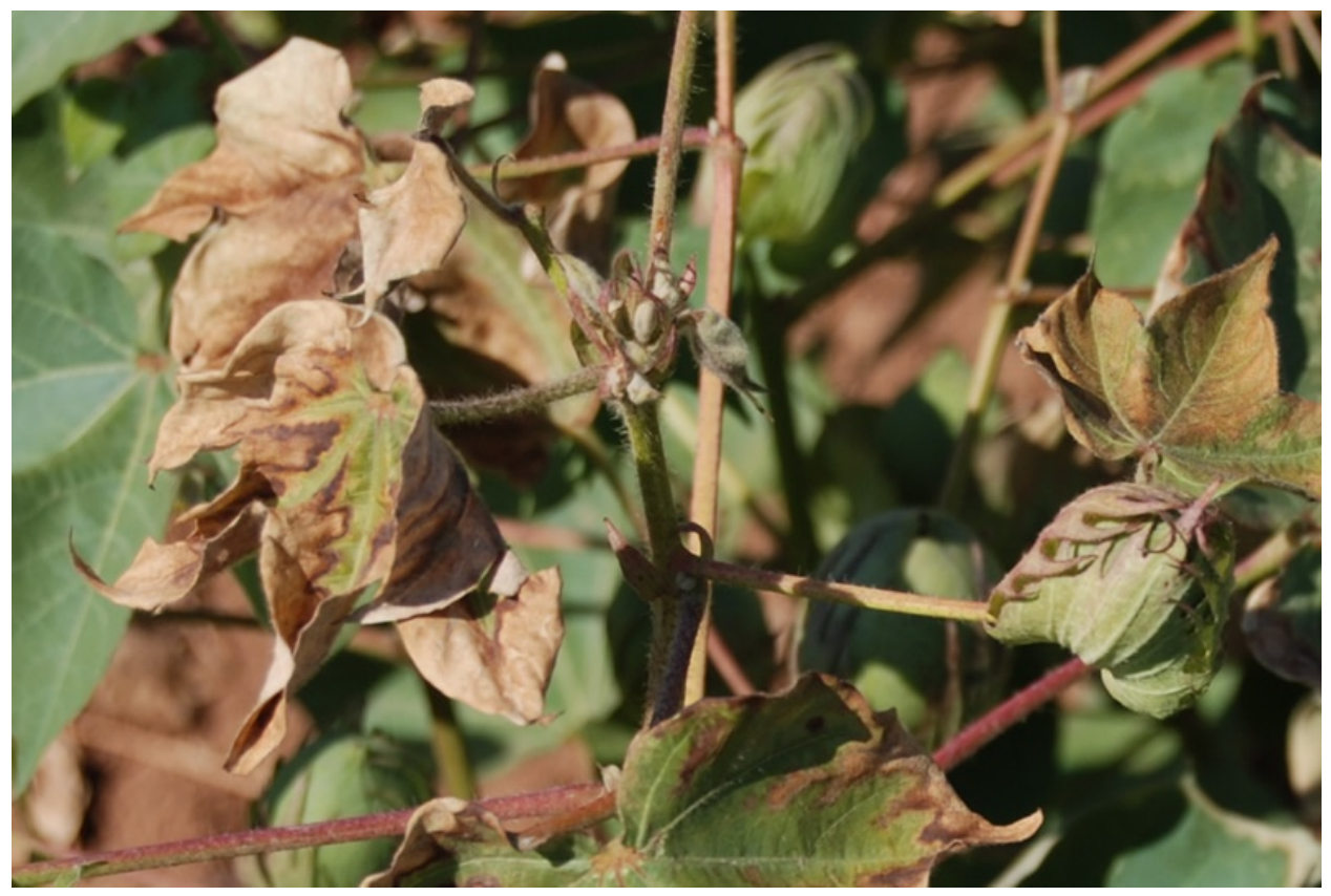
Leaf necrosis in drip-irrigated cotton