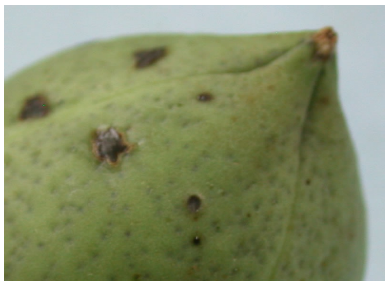
Lygus stings on a boll