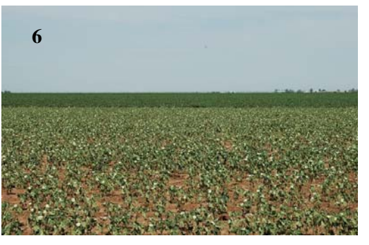
Dryland vs. pivot irrigated field

the ultimate yield to be set quickly. Drought stressed plants will adjust the yield based on