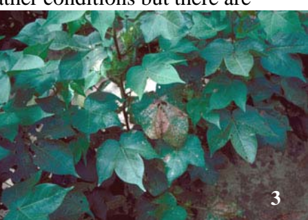
Early instar BAW feeding

no indications at this time that we should see any significant increase in activity from this pest. But remember that problems with armyworms