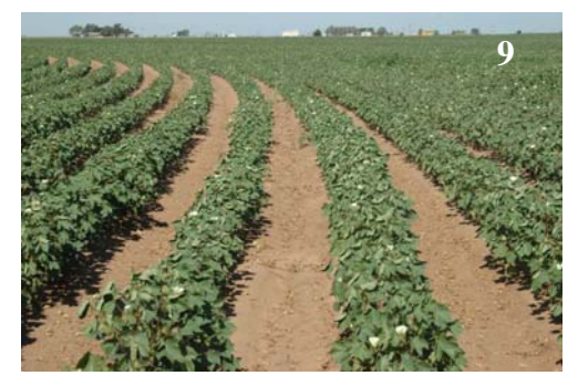
LEPA irrigated field blooming out the top

moisture. At Plains, some rainfall was obtained and substantial irrigation has been applied. This trial was about 5 NAWF