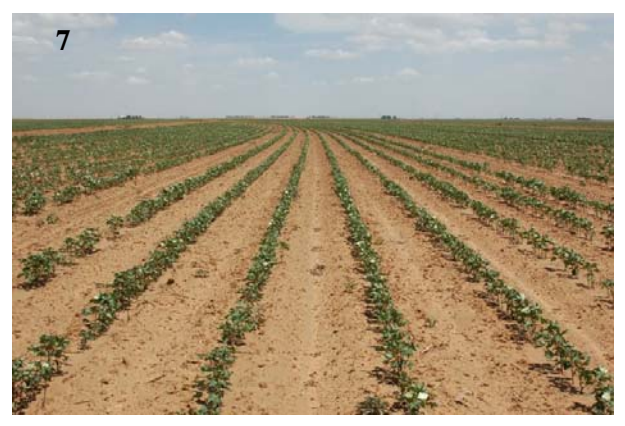
Dryland field in northern Lynn Co.

Continued extreme moisture stress will also adversely affect final boll size. Some dryland fields were initially established with good stand uniformity, but due to high temperatures and no