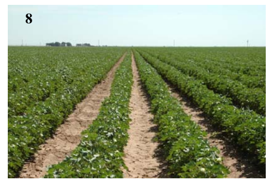
Crosby Co. drip irrigated field

rainfall in most areas is having a significant impact. Fields with high irrigation capacity continue to perform as expected. Over the past week, I have observed some optimumirrigated fields