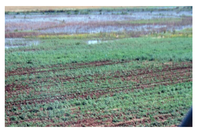
June rains bring weed problems.

Ready cotton is nearing the end of the over the top window for Roundup applications. We have been getting questions concerning Roundup applications on cotton that is past the 4-leaf overthe-top (OT) window. If late applications are made, then