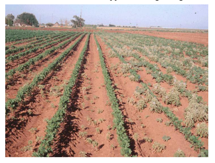
Potential fleahopper problem field.

All of the rains in June have fostered a veritable cornucopia of weed hosts for both cotton fleahoppers and Lygus bugs. This doesn't necessarily mean that we will see elevated numbers of these two pests across area fields anytime soon. However, surveys of various weed hosts continue to indicate the potential for fleahopper and Lygus problems. Thus far Lygus bugs have pretty much remained in noncotton hosts while fleahoppers are beginning to