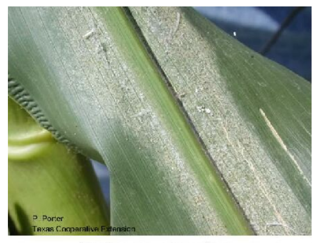
Banks grass mite colony

Spider mite numbers are increasing and moving up the plant in many areas. Most fields have 15 to 45% of the leaves with mite colonies. The last electronic edition of FOCUS had a lengthy segment on spider mites, so I won't repeat myself this week. Beware of the return of hot weather for it will stimulate mite populations and they could rapidly get out of hand. This photo illustrates a typical Banks grass mite colony on the underside of a leaf.