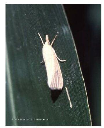
Southwestern corn borer adult

adults are on the increase. The ECB flight has started as well, but they are not as numerous as SWCB. These pests are a threat to non-transgenic corn. The SWCB threshold is 20 – 25% of plants infested with eggs or newly-hatched larvae. If the