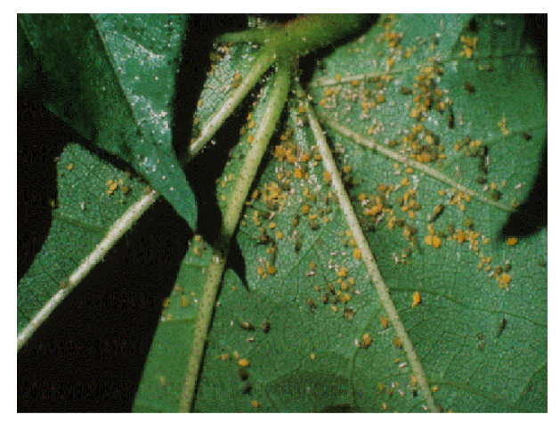
Aphids on underside of leaf

Aphid numbers remain generally low with only a few exceptions. Most aphids are found in the terminal area and can be counted on the fingers of two hands. Under these conditions, our natural enemy populations appear to be keeping them in check. There are some fields where aphids now infest more of the plant, producing noticeable honeydew deposits. These field spots are generally small and have attracted lots of predators. My advice has been to ignore these situations and let the "beneficials" build up in these spots. Once more of the field is involved and aphid infestations have moved down to the middle or bottom leaves, then it is time to think about control. I am concerned that the widespread use of pyrethroids for bollworm control will result in the development of aphid problems in the near future.