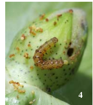
5 day old larva (1/2")

released form our area corn to the north used to be a big problem but reduced acreage and Bt corn plantings have greatly reduced their impact. Not only can greater numbers of moths arrive in our area from South Texas but they can be more difficult to control with pyrethroids due to increased tolerance