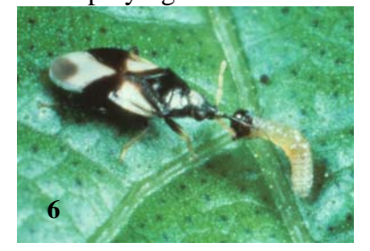
Minute pirate bug adult

change all this so be very judicious in your use of these and other insecticides. We have a pretty good number of natural enemies out there helping us. Let them do their job.