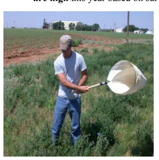
Sweeping roadside alfalfa.

As I reported last week, Lygus bug numbers are high this year based on surveys of several