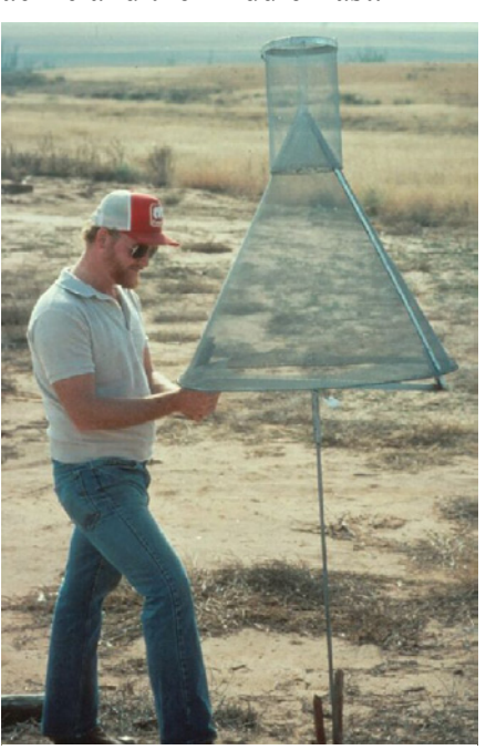
Checking a T-P trap.

Both species feed on similar plants including cotton, corn, soybeans, sorghum and sunflowers. This potential pest is on the Homeland Security list (for Texas) along with 6 other insects and diseases. Texas Department of Agriculture is getting funding through USDA-APHIS CAPS programs to do surveys for these pests.