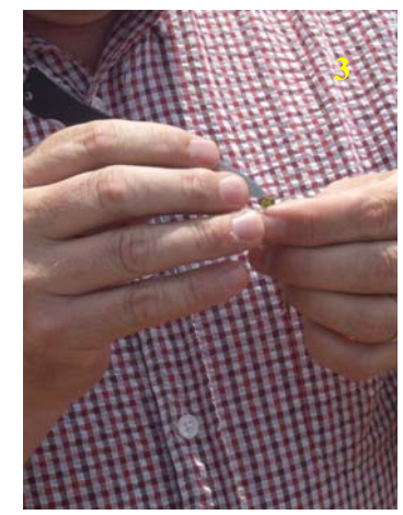
Checking terminal for thrips

and wingless immatures or by beating plants into a white surfaced container like a cigar box or deep pie plate and counting dislodged thrips. You will still need to dissect the terminal area to locate thrips in small folded leaves.