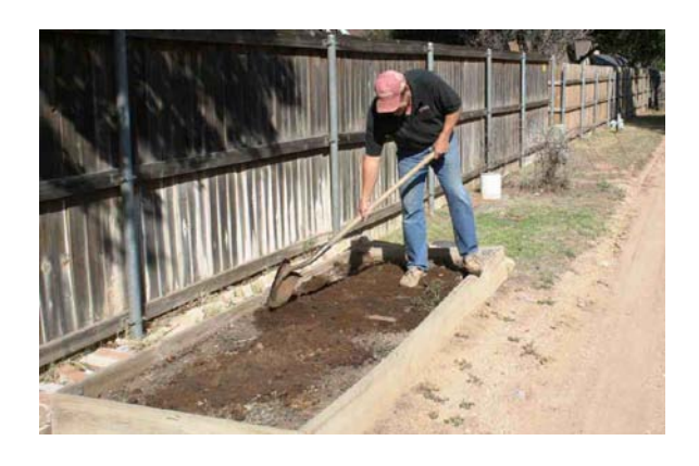
Step 3 –Prepare the strawberry planting bed by digging the soil around the edges and then throw the soil into the center to build up the bed approximately 6 to 12-inches in height and about 24-inches wide.