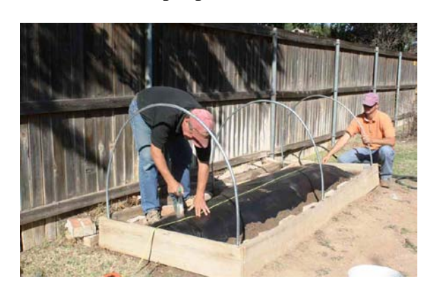
Step 8b – Note even spaced and staggered holes between the two rows which will be used for transplanting the strawberries.