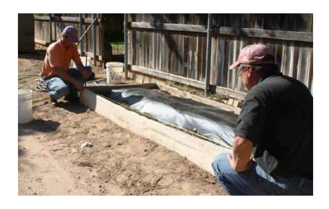
Step 6b – Hammer the rebar ground posts into place at the locations where the tunnel hoops will be set.