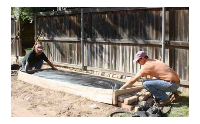
Step 5b – Bury the edges of the black plastic mulch with enough soil to prevent high winds from lifting it off the ground.