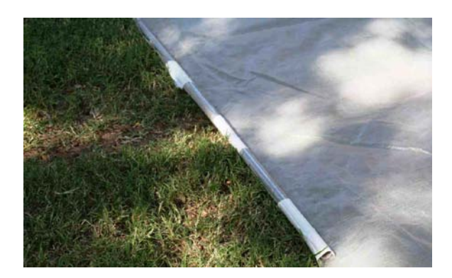
Step 11b – Cut off excess plastic from zip ties. The pipes can also be used to tie the sides of the tunnel to the ground.

Step 11a – Spread out the tunnel plastic covering for measuring and cut to correct size. Place pipes on sides and secure using duct tape, zip ties or clamps.