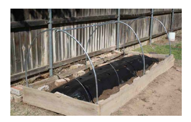
Step 9b – For this low tunnel, hose clamps were used to secure the purlin to the hoops. Be sure to have any sharp edges below the frame so the plastic covering won't tear.