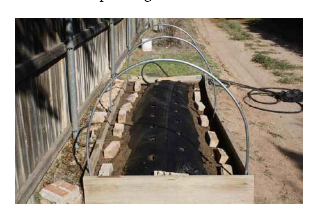
Step 8b – Note even spaced and staggered holes between the two rows which will be used for transplanting the strawberries.