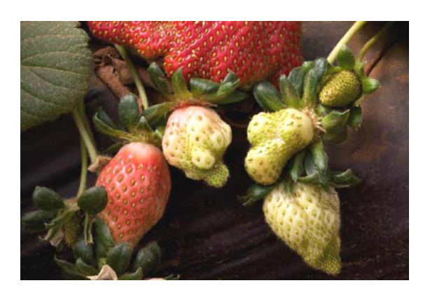
Figure 3. Misshapen berries photographed March 22, 2012 resulting from poor pollination due to excessively cold temperatures.

increase fruit quality and yields. On the Texas High Plains, the winds can aid in the self-pollination process. Poorly-shaped berries may occur when winds and bees are absent resulting in cat-faced or irregularly-shaped fruit. Cold temperatures during the off- season (December through early March) may also result in misshapen and abnormal berries (see Figure 3).