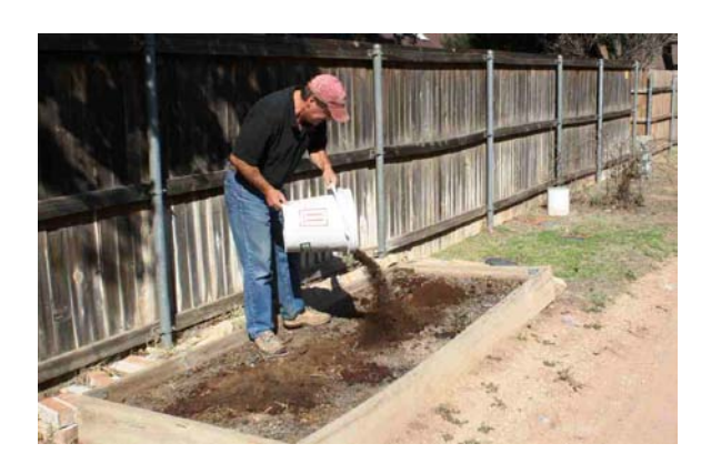
Step 2b – Spread out the compost or fertilizer and mix thoroughly into the top 6-inches of garden soil.

Step 2a – Add compost or other pre-plant fertilizer to the garden soil.