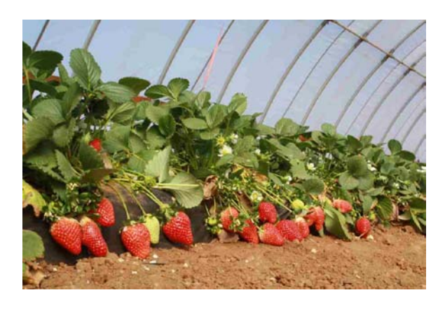
Figure 1. Strawberries ready to be harvested on March 2, 2012 in high tunnels located at the Texas A & M AgriLife Research and Extension Center at Lubbock.

Strawberries ( Fragaria ananassa ) are a very popular small fruit for home gardeners. On the High Plains of Texas and in surrounding regions, strawberries can be difficult to grow, often leaving home gardeners feeling very frustrated. However, with proper growing techniques, transplant timing, and tender loving care, high yielding and quality strawberries can be achieved (see Figure 1).