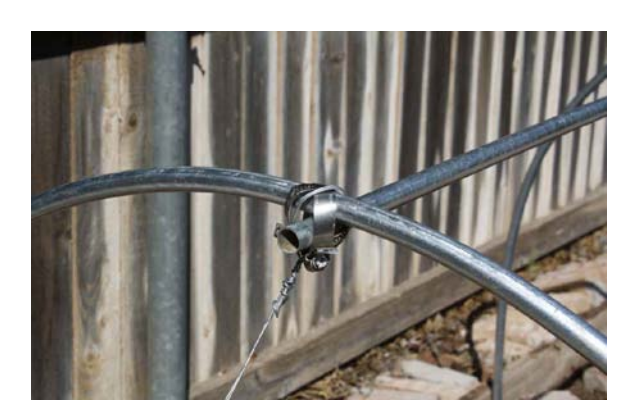
Step 10 – Secure the tunnel frame with wire at both ends to rebar previously hammered into the ground to help stabilize the frame.