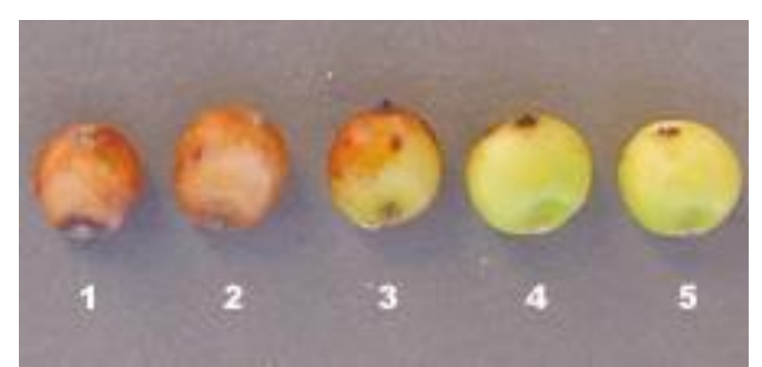
Figure 1. Sorghum kernels in various stages of maturity harvested from the same head from the most mature (1) to the least mature (5). The black layer is first readily visible in (3) and becomes more distinguishable as the seed loses moisture. Do not confuse black layer, which develops where the seed is attached to the plant (bottom end when in the head), with the black dot on the opposite end of the seed.

For a summary of grain sorghum harvest aid uses in Texas grain sorghum, consult AgriLife's "<u>Harvest Aids in Sorghum</u>" (L-5435).