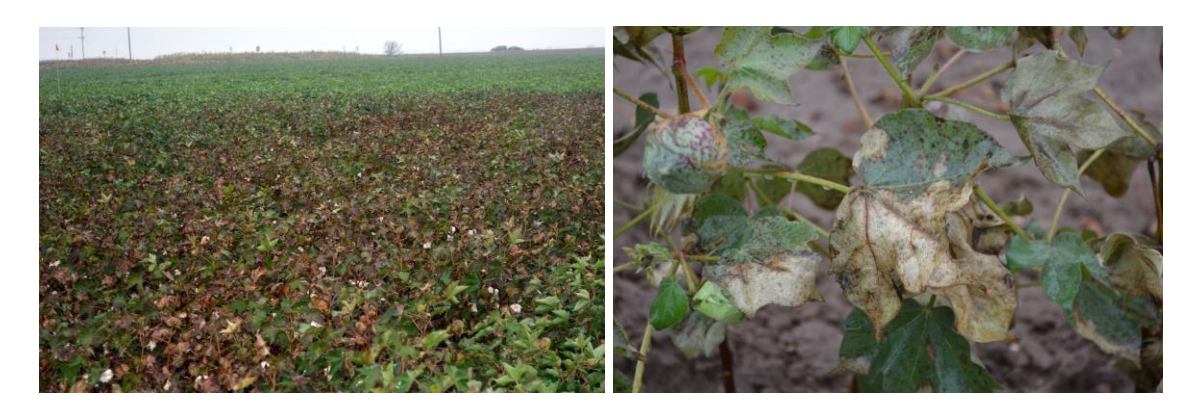
Figure 2. Early leaf senescence seen in dryland/water stressed cotton fields