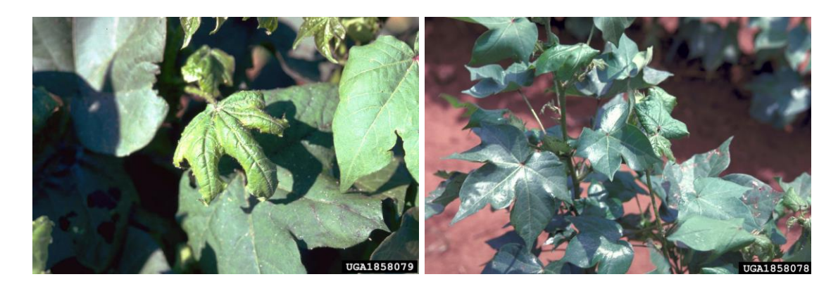
Figure 1. Symptoms of cotton aphid infestation in cotton

which look unusual; leaves are drying out as if someone has put out harvest aid application ( Figure 2 ). I have seen such fields in Lubbock and found that there has been no chemical application made to those fields. Rather this appears to be the result of weather event we experienced recently. After the hot and dry weather which stressed out the cotton plants, mainly dryland acres, we received a spell of cold and wet weather last weekend. It could be that the sudden change in weather conditions may have caused the leaves to senesce (die) prematurely. This is my educated guess and in part it results from discussions with my colleagues here at the Experiment Station. There could be other factors such as nutrient deficiency involved in such premature leaf senescence syndrome. I will try to provide more information as soon I find some more details on this topic. Please do not hesitate to reach me at <u>Apurba.Barman@ag.tamu.edu</u> or 806-407-2830 (cell) regarding any cotton insect related questions. AB