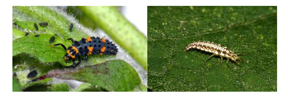
Figure 2. Two primary beneficial insects those feed on cotton aphids: lady beetle (left) and lacewing (right) larva