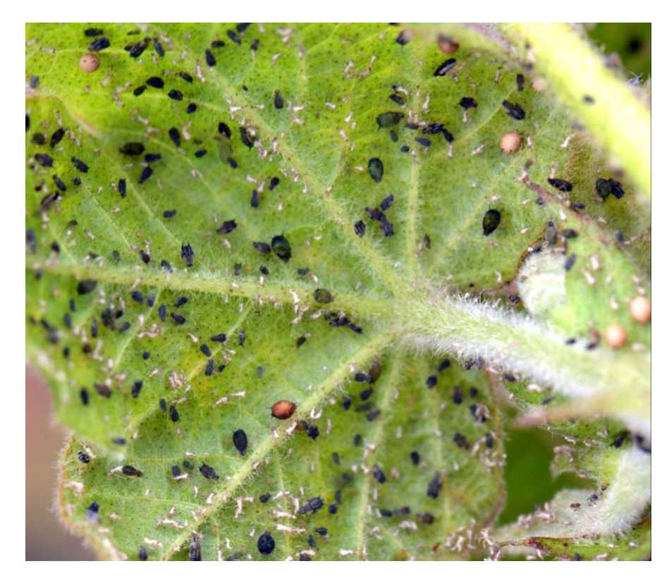
Figure 1. Cotton aphids on underside of a cotton leaf