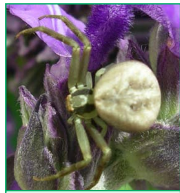
Figure 8. Crab spider on a flower.

Crab spiders, in the family Thomisidae, are common on leaves and flowers (Fig. 8), and some species are found on the ground. These