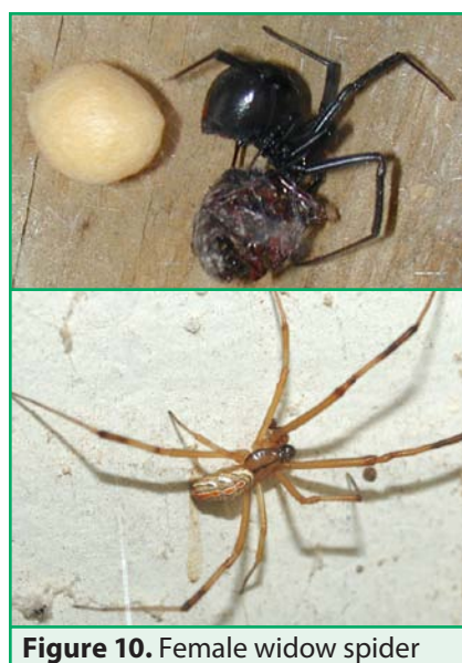
Figure 10. Female widow spider (top), male widow (bottom).

Widow spiders are usually found in protected areas outdoors or in structures that are open to the outdoors. They may live in wood