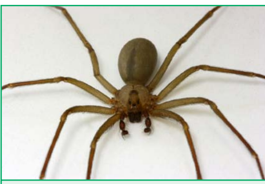
Figure 9. Recluse spiders have six eyes arranged in three pairs.

Recluse spiders are most active at night but can occasionally be seen during the day. They actively hunt insects and other arthropods and do not use a web to trap their prey. Their web is used mostly as a