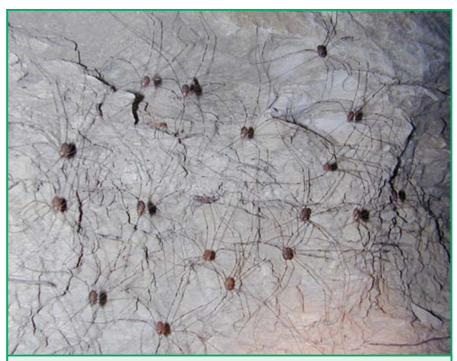
Figure 11. Harvestmen are sometimes seen in colonies, where they may bounce up and down together.