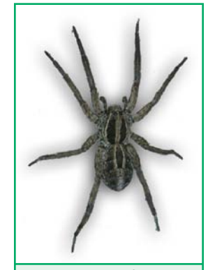
Figure 4. Wolf spider, Schizocosa spp.

They are hairy and their drab color is mottled with brown, gray, black, yellow, or creamy white markings. They have eight eyes, with a front row of four tiny eyes in a straight line and a larger central pair in the hind row. Wolf spiders often have two dark, longitudinal stripes on the cephalothorax (Fig. 4). They range ½ to 3 inches long.