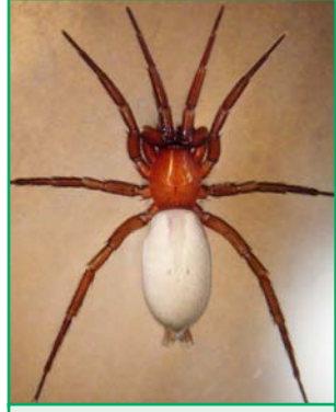
Figure 1. Ground spider showing cephalothorax, abdomen and eight legs.

The spinnerets and a distinct abdomen distinguish spiders from the other arachnids.