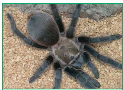
Figure 2. Tarantula, Aphonopelma.

are sometimes lined with silk webbing and are covered with a thin silk curtain. In the winter or the hottest months of summer, these burrows