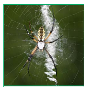
Figure 5. Argiope spider in a web.

The black and yellow garden spider, Argiope aurantia , is common in Texas, and is the best known in the group (Fig. 5). The female's body is more than 1 inch long and its legs are even longer. Male Argiope are often less than one fourth the size of females and can be found in the same web with the female.