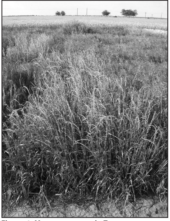
Figure 1. Mature ryegrass in Texas.

One of the most effective methods for managing resistant ryegrass populations is crop rotation. Rotating to a summer crop allows you to use