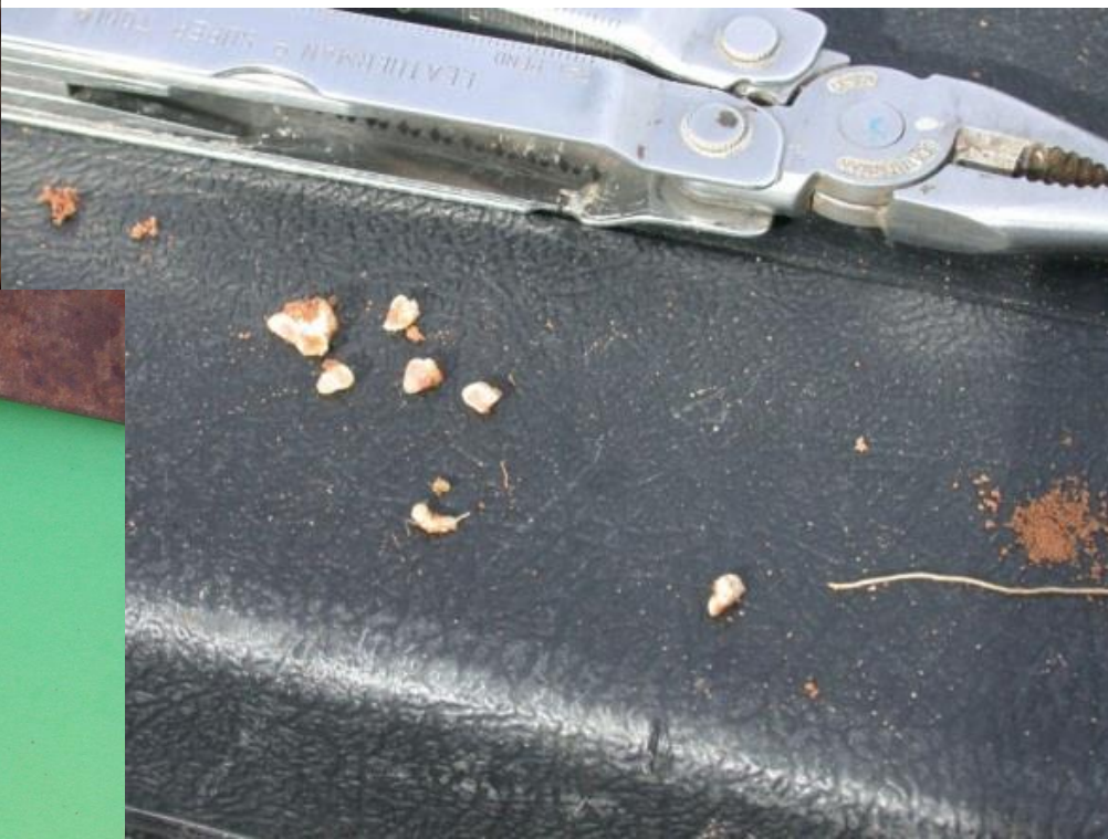
Rhizobium nodules on guar roots