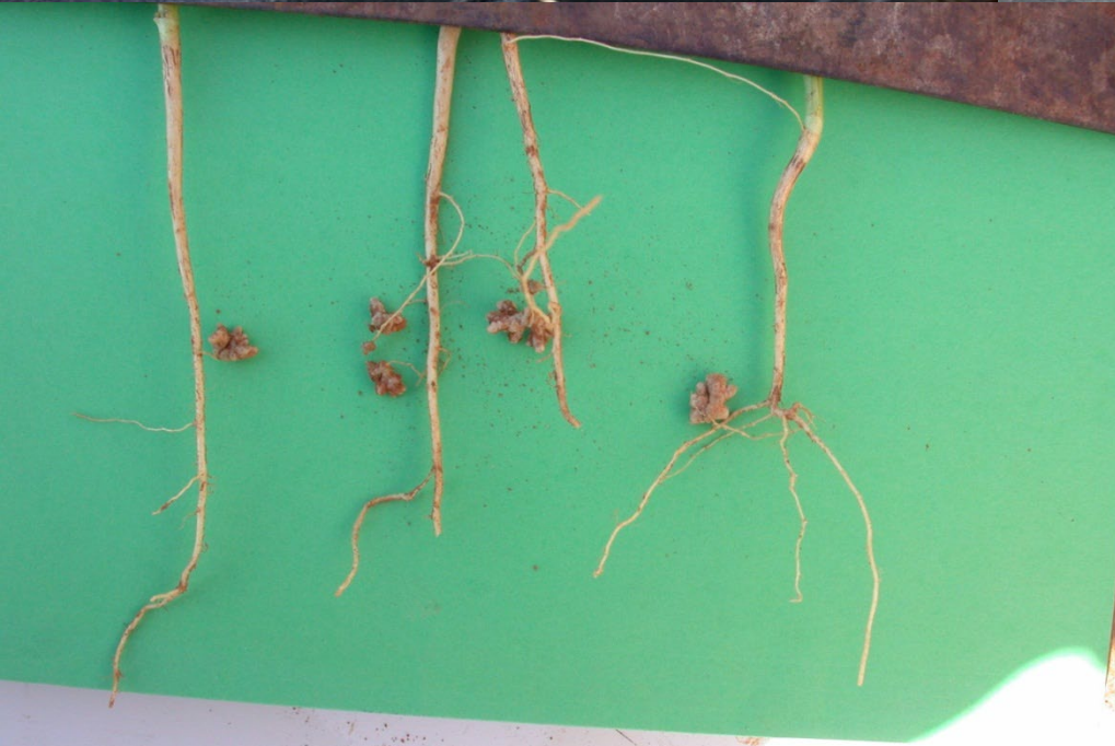
Rhizobium nodules on guar roots