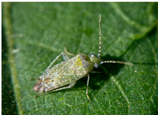
Figure 4. Adult cotton fleahopper.

cotton. However, data suggests that cotton fleahopper management with insecticides in ThryvOn cotton will be superior to non-ThryvOn cotton.