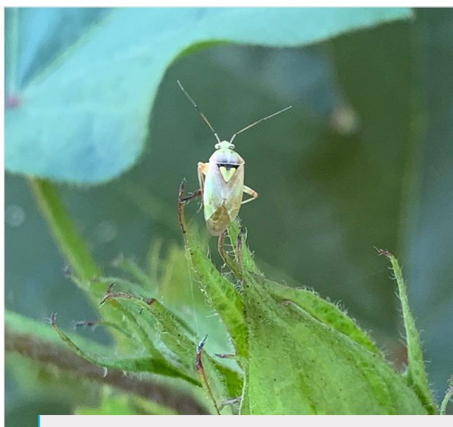
Figure 3. Adult tarnished plant bug.

ThryvOn cotton is not labeled for managing cotton fleahoppers (Fig. 4). However, data collected by Texas A&M AgriLife Extension has demonstrated that ThryvOn has activity on cotton fleahoppers, similar to that observed for tarnished plant bugs. ThryvOn cotton will be readily colonized by adult cotton fleahoppers, but fewer large nymphs will survive. Furthermore, the authors have observed that ThryvOn does affect cotton fleahopper feeding behavior, which results in less cotton fleahopper-induced square loss. Thus, when cotton fleahoppers are present, ThryvOn cotton tends to have better square retention relative to non-ThryvOn cotton. Currently, Texas A&M AgriLife Extension recommends utilizing the same action thresholds for cotton fleahoppers in ThryvOn cotton as for non-ThryvOn