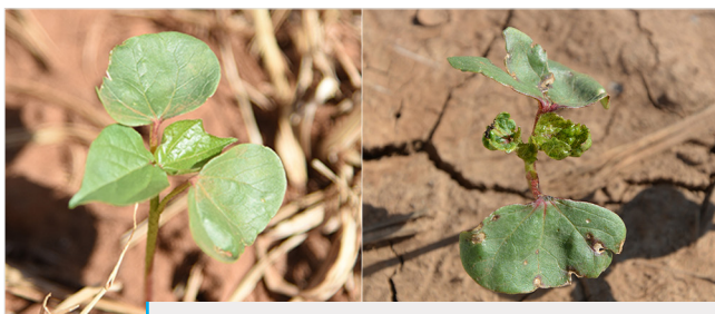
Figure 1. ThryvOn (left) and non-ThryvOn (right) cotton seedlings under heavy thrips pressure.

Data collected by Texas A&M AgriLife Extension has demonstrated that ThryvOn cotton does not